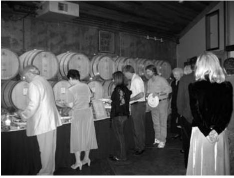
OPA members and guests dine in style at the Silver Rose Winery in Calistoga.